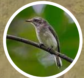
Sri Lankan Woodshrike