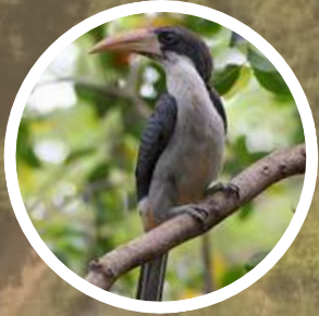
Sri Lanka Grey Hornbill