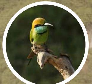
Little Green Bee-Eater