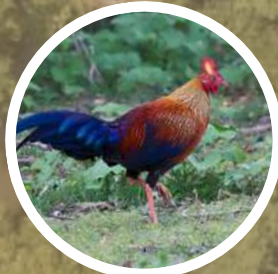
Sri Lankan Jungle Fowl