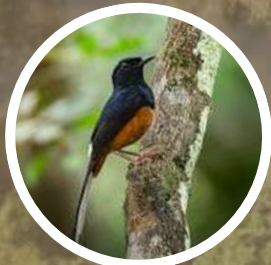
Sri Lankan Shama