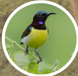
Purple rumped Sun Bird