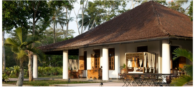
MesaStila, Central Java