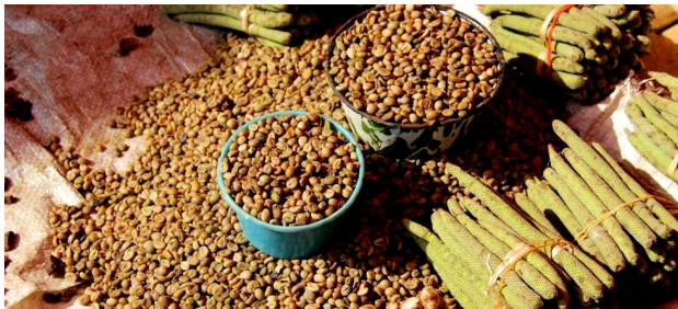
Javanese Coffee Beans