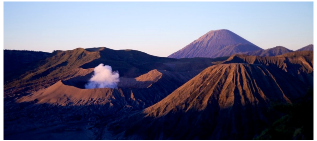
Mount Bromo, Surabaya