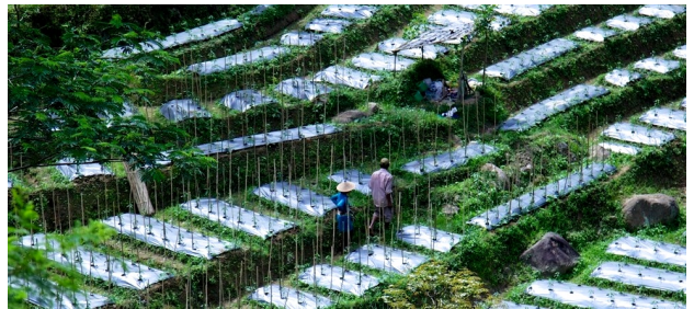
Rice Paddies, Selogriyo