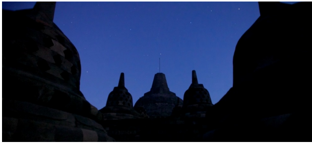
Borobudur at Night, Yogyakarta